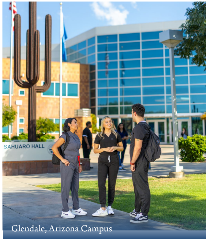
Glendale, Arizona Campus